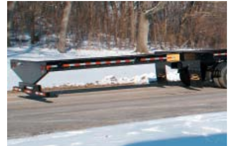
Pull out rear underride bumper (optional)