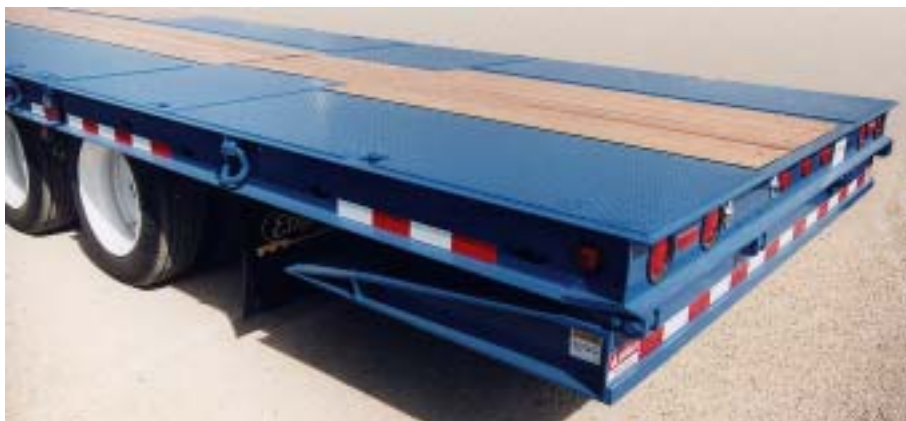
Etnyre custom designed tiedowns and optional stake pockets.