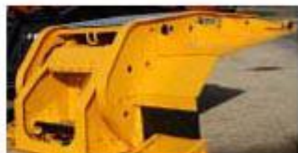
Optional gooseneck storage area and optional gooseneck fenders.