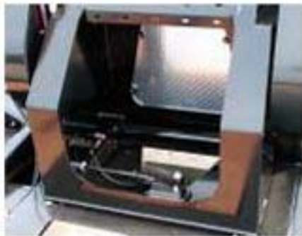
Air operated gooseneck lock pin.