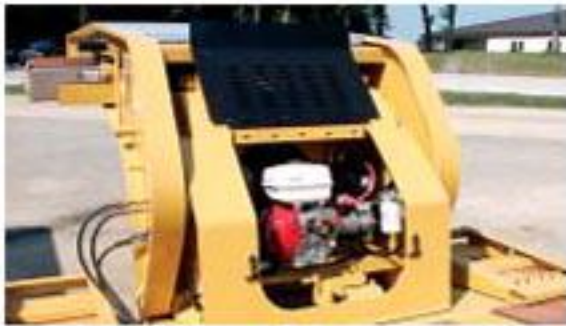
Optional self contained engine package.