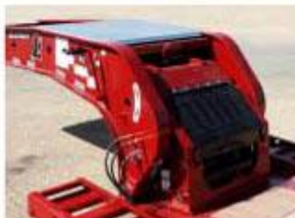
Bolt-on 1/8" aluminum floor plate gooseneck cover.