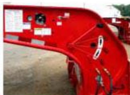
Simple one hand adjustment of deck height and or fifth wheel settings. No doors, shims or spacers.