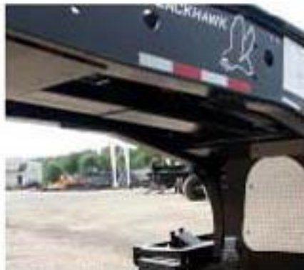
Hydraulically operated gooseneck support arm and gravel guard.