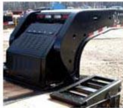
Optional gooseneck light bar and full lockable rear cover.