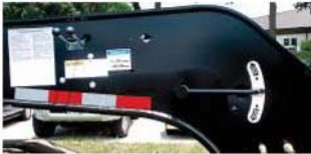
Simple one hand adjustment of deck height and or fifth wheel settings. No doors, shims or spacers.