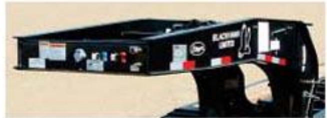
Simple, quick and easy hook-ups to any tractor, electrical and hydraulic system.