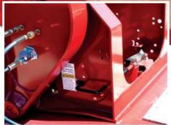
Gooseneck lock pin