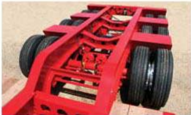
Rear section with spring suspension.