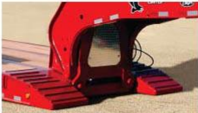
Optional gravel guard and optional fixed front ramps.