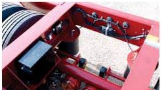
Optional battery and flasher kit