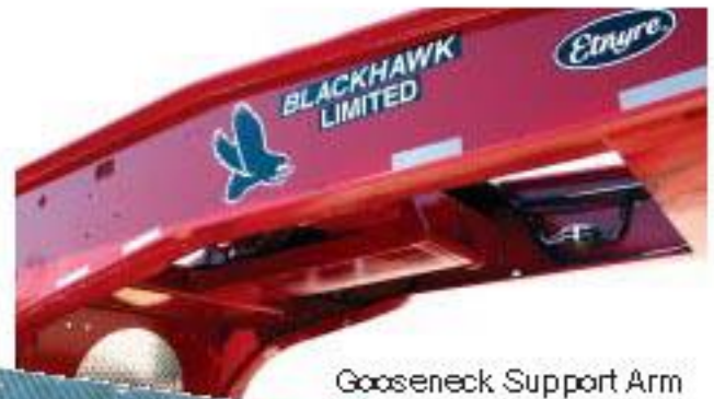
Gooseneck Support Arm