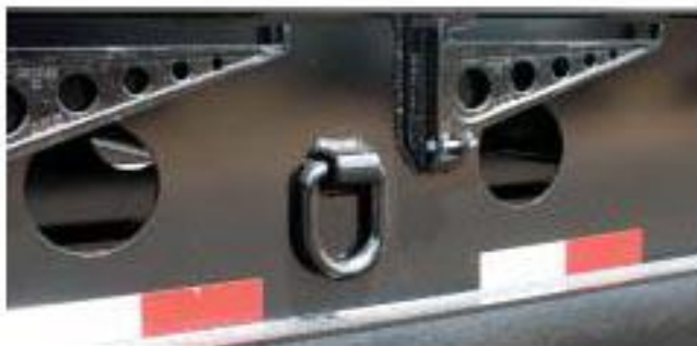
Flat style lash rings and outriggers