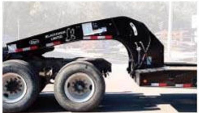
High lift gooseneck. Higher lifting capacity and more travel (above and below ground level) than any of it's competitors.